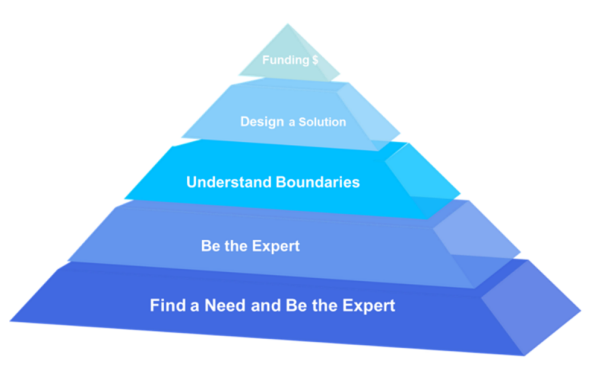
Figure 2: Sequential flow of how the course is administered. Students are introduced to the concept that their end goal is to ask for funding. Each assignment builds on the other to achieve the final goal.

In this course, students were asked to complete various assignments throughout the semester that were necessary for the final project of the course. The goal of the project was to develop a medical device and write a grant to ask for funding from an investor. Students were given a clear message as to what the end goal of the course is which is shown in Figure 2. This was implemented as one of the strategies by introducing this in the first week of class, on the syllabus and in periodic announcements.